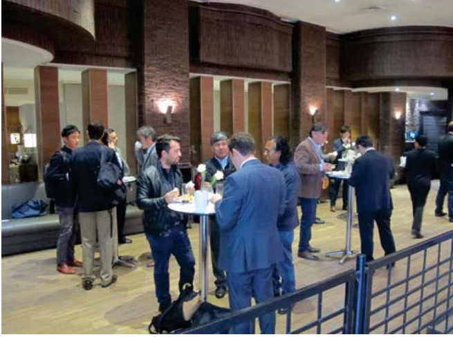
JCM Seminar and business matching in Chile in August 2019