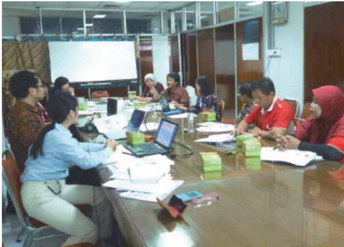
Local stakeholders consultation

“Innovation, deployment, and transfer of low-carbon technology through the Joint Crediting Mechanism (JCM)” 14 th December 2017